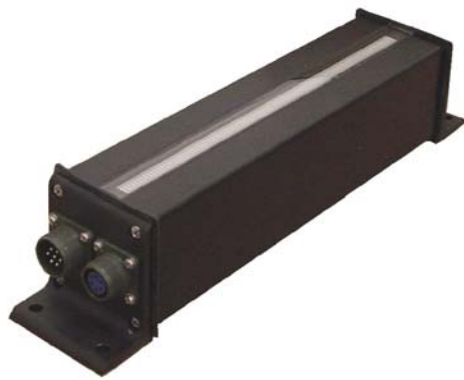
Model 10XAS-10E-B Emitter—Standard Enclosure

The B-type aluminum standard enclosure provides excellent dust and moisture protection for most environments. The optional ULTRA-TOUGH™ enclosure is designed for harsh environments found in steel mills and other industrial applications.