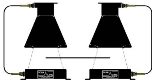
Model 10XAS-10E-B Dual-Sensor System