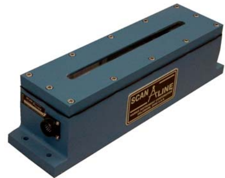
Model 10XAS-10E-UT Emitter—Ultra-Tough Enclosure